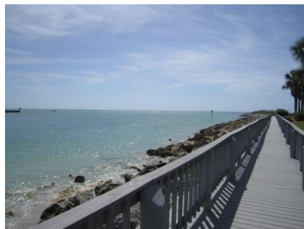
3:24 PM Thursday, March 8 2012 Southwest

5. This is at the bottom of St. Petersburg! My mother recently moved here for work and now I get the pleasure of seeing her and this beautiful place on breaks! (Natural Place)