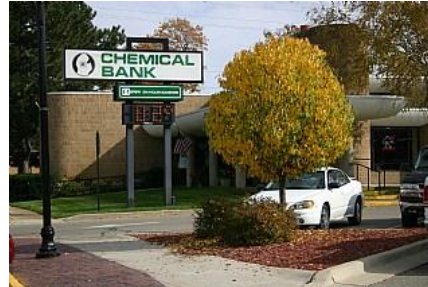
Was not taken by myself ( http://www.downtownstlouismi.com/1/207/ImageLib/320_1_ChemicalBank2%281%29.jp )

10. This picture is of Chemical Bank. I have worked here for about three months at the Grandville location. We serve the Michigan communities with great customer service. (Movement of goods and services)