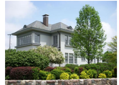
2:07 PM Friday, May 2011 Southwest

1. This is the Kellogg house in downtown Battle Creek on Monroe St. The Kellogg house is the house in which W.K and John Kellogg grew up. They together were the founders of Kellogg cereal. (Absolute Location)