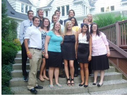
5:28 PM Wednesday, August 17 2011 East